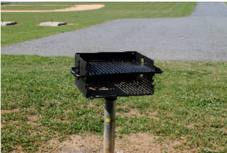
Two new grills were installed at Dentler Park. To reserve the park, call 532-9041.

We realize that it is only a few bad apples but we can't and won't post a guard on this park. It is there for everyone's enjoyment and we hope the neighbors can find out the culprits and stop the vandals. Don't be afraid to call the State Police if you see improper activity at the park. It is your park and we cannot keep it open without your help.