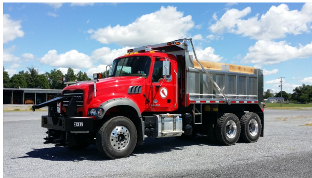
Southampton Township's New 2017 Mack Tandem Dump Truck

The photography contest that was started April 1st is being extended. We have received some beautiful spring and summer pictures of our Township, but feel we may be missing out on some colorful autumn and cold winter pictures. Therefore, the Photography contest has been extended until March 31, 2017. All of the same rules apply, so go to our website and click the "Photography Contest" link and submit your best Southampton pictures.