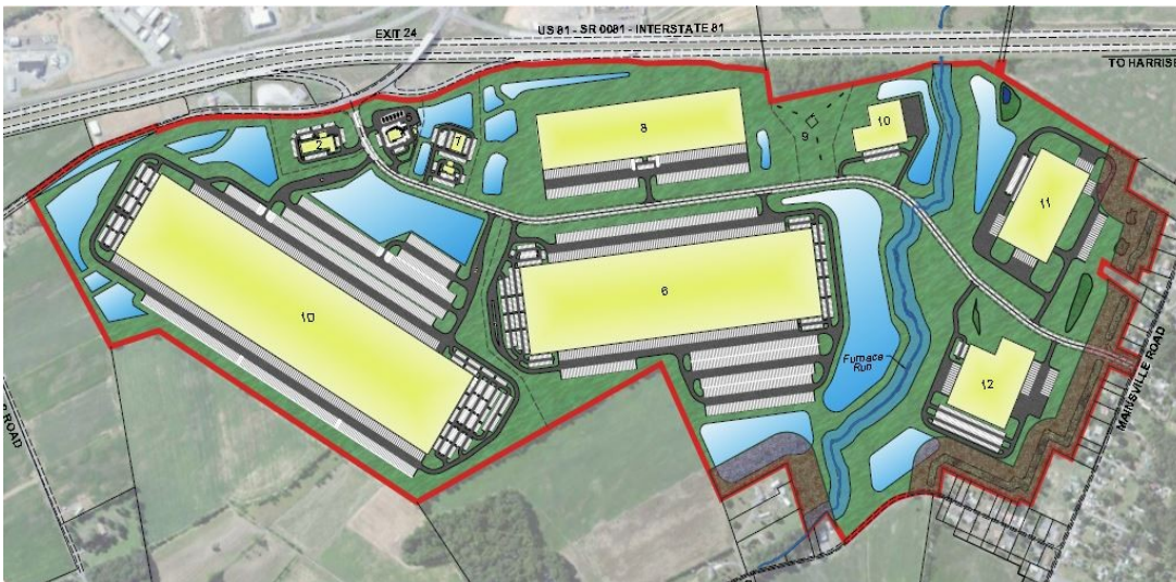
United Business Park—Master Conceptual Plan

United Drive will be extended in to reach the second warehouse which is 1.2 million sf. on 93.6 acres (Lot 6). There will be 459 total regular vehicle spaces, 483 trailer storage spaces and 235 loading dock spaces. At this time there is no known end user for either warehouse building.