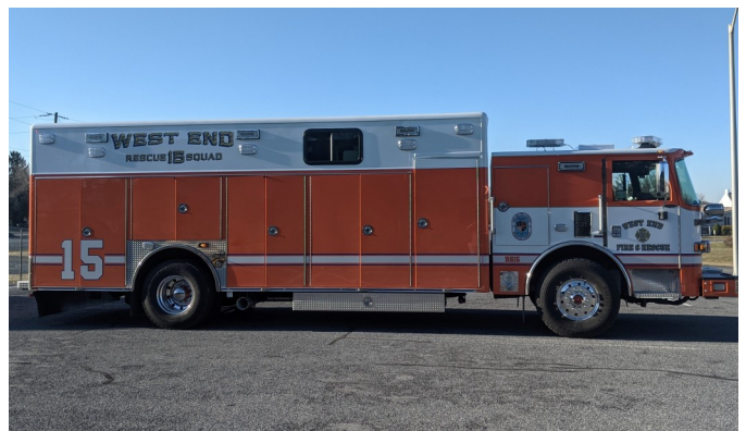
West End Fire and Rescue's new heavy duty rescue squad increases service capabilities and special operations.

Beginning the first week of May, the ATS Speed Trailer will be put out to collect traffic data on various roads. If you would like to request data for a certain road or area, please give us a call so you can be put on the schedule as soon as possible.