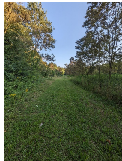
Mowed Walking Path at Furnace Run Park

Throughout the summer, we will be mowing along the shoulder of the roadway. Please use caution while passing the mowers.